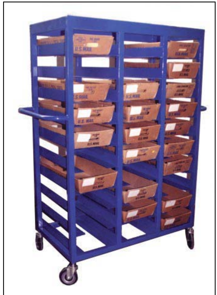
TrayTruker I — MM